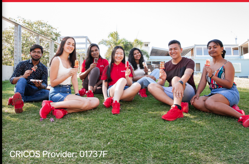
CRICOS Provider: 01737F

Australian currency looks like this (see left). As a student it's important to be attentive to your budget and set up a bank account when you arrive. See below for a rough idea of your expected expenses.